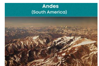
Andes (South America)