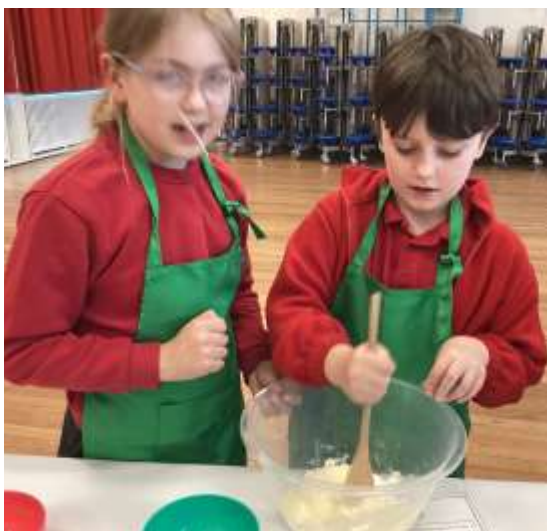
Baking club enjoyed making fairy cakes this week. It was hard work beating the sugar and butter together and cracking the egg so that it went inside the bowl! Children told me that they were delicious!