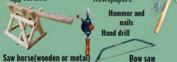
Saw horse(wooden or metal)