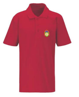
Red polo shirt with St Saviour's logo