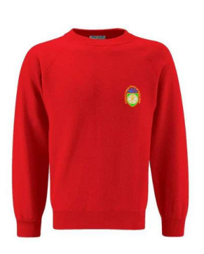
Red sweatshirt with St Saviour's logo