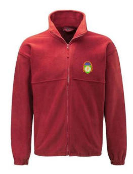
Red fleece with St Saviour's logo