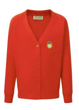
Red cardigan with St Saviour's logo